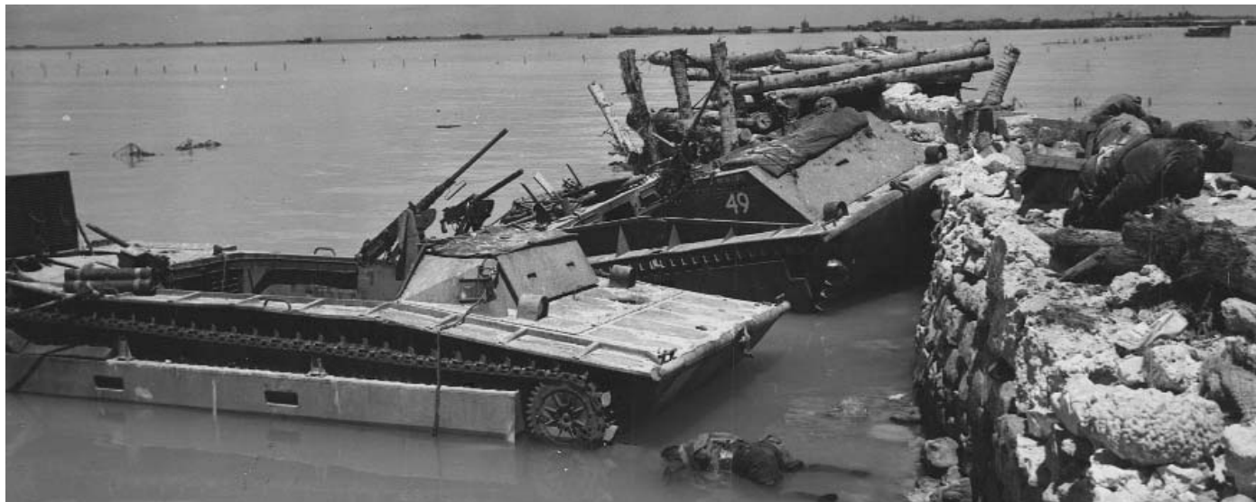
LVT(1) #49 and LVT(2) in foreground knocked out by gunfire on beach at Tarawa. Note penetration of boilerplate on cab of LVT(1) #49 by machine-gun fire.