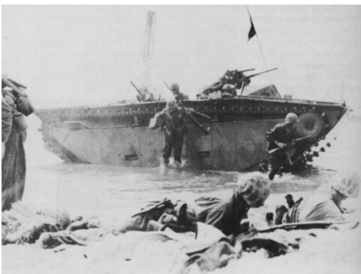
Marines land from LVT(2). The high drop required of troops laden with individual weapons and equipment was always difficult, as was cargo-handling over the side.