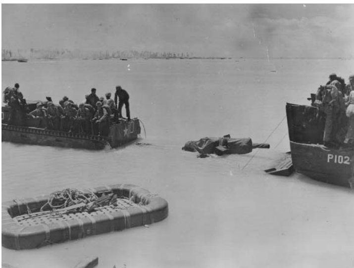
LVT(1) towing 105mm howitzer offloaded from LCM on reef.

day. The resulting activity, and a 6 January sailing date, shattered the meaning of time for the amtrac community at Camp Del Mar where the 1st Armored Amphibian Tractor Battalion was also based. That unit, formed in July, had 75 LVT(A)1s armed with 37mm guns. Intended to cover the movement ashore of the troop carrying amtracs, the armored amphibians would henceforth constitute the first wave in all landings.